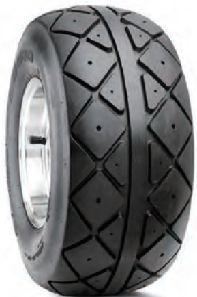
DI-2014 TOP FIGHTER